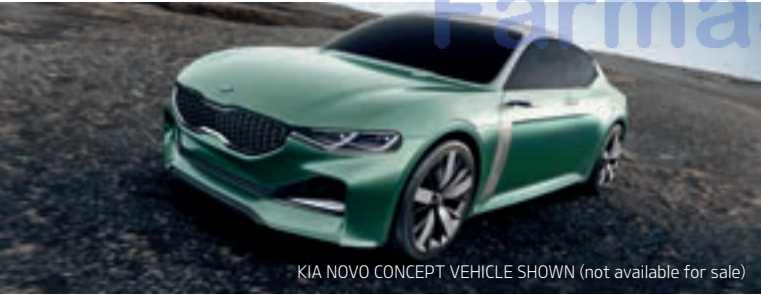
KIA NOVO CONCEPT VEHICLE SHOWN (not available for sale)