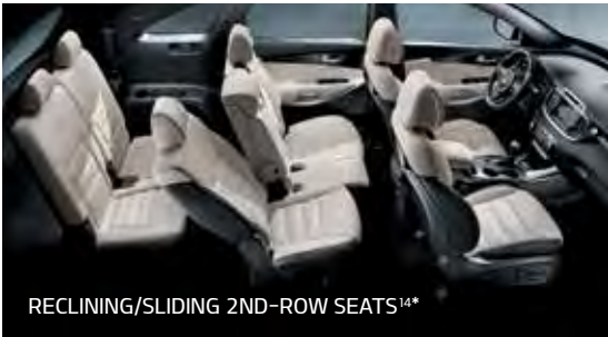
RECLINING/SLIDING 2ND-ROW SEATS 14*