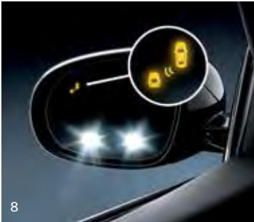
8. BLIND-SPOT DETECTION WITH LANE-CHANGE ASSIST 1*

Available Surround-View Monitor utilizes four cameras at the front, rear, and sides to provide a view around the vehicle. This helps enhance driver visibility when maneuvering into parking spaces.