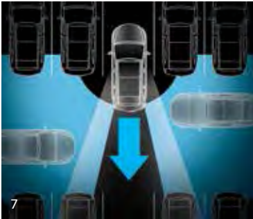
7. REAR CROSS-TRAFFIC ALERT 1*

Available Lane Departure Warning System is designed to detect the vehicle moving out of its lane without the turn signal being used. When it does, the advanced system alerts the driver with a combination of audible and visual warnings.