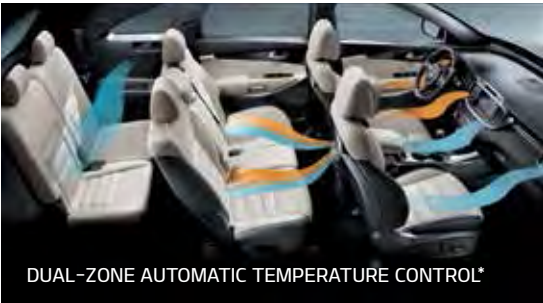
DUAL-ZONE AUTOMATIC TEMPERATURE CONTROL*