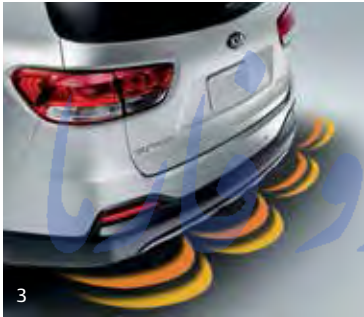
3. REAR PARK ASSIST SENSOR 1*

To help you see things behind your vehicle that you might not see by looking over your shoulder, Sorento features an available Rear-Camera Display with a large and bright screen.