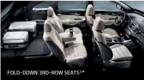
FOLD-DOWN 3RD-ROW SEATS 13*

SOUND-INSULATING LAMINATED GLASS* For a quiet and luxurious drive, the windshield and front-door windows feature available laminated sound-insulating glass. It incorporates two distinct layers of thin film on each side of the windows’ insulating center layer.