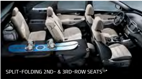
SPLIT-FOLDING 2ND- & 3RD-ROW SEATS 13*