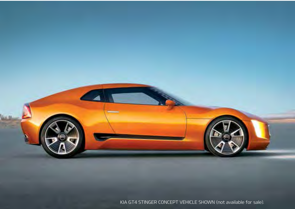
KIA GT4 STINGER CONCEPT VEHICLE SHOWN (not available for sale).

COMPELLING DESIGN Kia vehicles have captured worldwide attention for their interior and exterior styling, which represents the collaborative work of designers who have created a look that makes every Kia recognizable at first sight. Today, the lineup consists of vehicles that fill owners, as well as Kia’s designers, with pride.