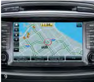
9. VOICE-COMMAND NAVIGATION *

Available Forward Collision Warning System activates alerts when the vehicle detects objects immediately ahead that may cause a potential impact, encouraging the driver to decelerate.