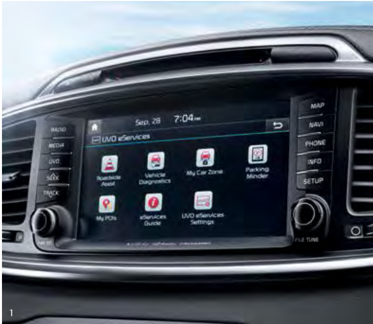
1. UVO — SHORT FOR “YOUR VOICE”

Sorento is equipped with impressive systems that monitor your driving environment. Innovative available features include Advanced Smart Cruise Control, 1* Rear Cross-Traffic Alert, 1* and Blind-Spot Detection with Lane-Change Assist, 1* which utilizes a radar system to detect vehicles in the driver's blind spot and recognize those approaching from behind.