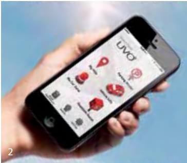
2. UVO eSERVICES APP 5

The available UVO eServices 5 Infotainment System uses advanced voice-recognition technology to let you conveniently manage your music and enjoy hands-free 5 use of your phone — with simple, intuitive verbal commands. It provides you with an easy way to connect to your vehicle by seamlessly integrating your compatible smartphone 7 with your Sorento. UVO eServices 5* can access Local Search powered by Google TM® when it is connected wirelessly to an Internet hotspot, 5 and it allows you to use a web-enabled computer to send locations that you find on Google Maps TM® mapping service to the navigation system for route guidance. It also lets you stream music, download apps from the App Download Center, 5* monitor your vehicle's driving habits, access 911 Connect 9* or Enhanced Roadside Assist, 10* and check maintenance requirements with Vehicle Diagnostics 11* on the large-capacitive touch screen.* Additionally, there are no subscription fees 5 to enjoy all these benefits.