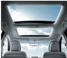
PANORAMIC SUNROOF (SX) (available w/Black Dove high-style interior seating color)