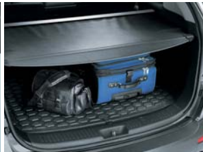
CARGO COVER/CARGO MAT