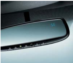
AUTO-DIMMING REAR-VIEW MIRROR WITH HOMELINK®22 AND COMPASS