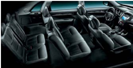
50/50 SPLIT-FOLDING THIRD-ROW SEATS (LX) Requires Convenience Package.