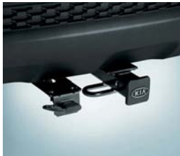
TOW HITCH 13