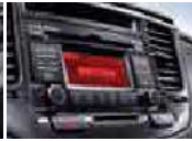
CONTROLS AT YOUR FINGERTIP* Steering-wheel-mounted controls, standard on SX models, let you operate the cruise control and audio system.