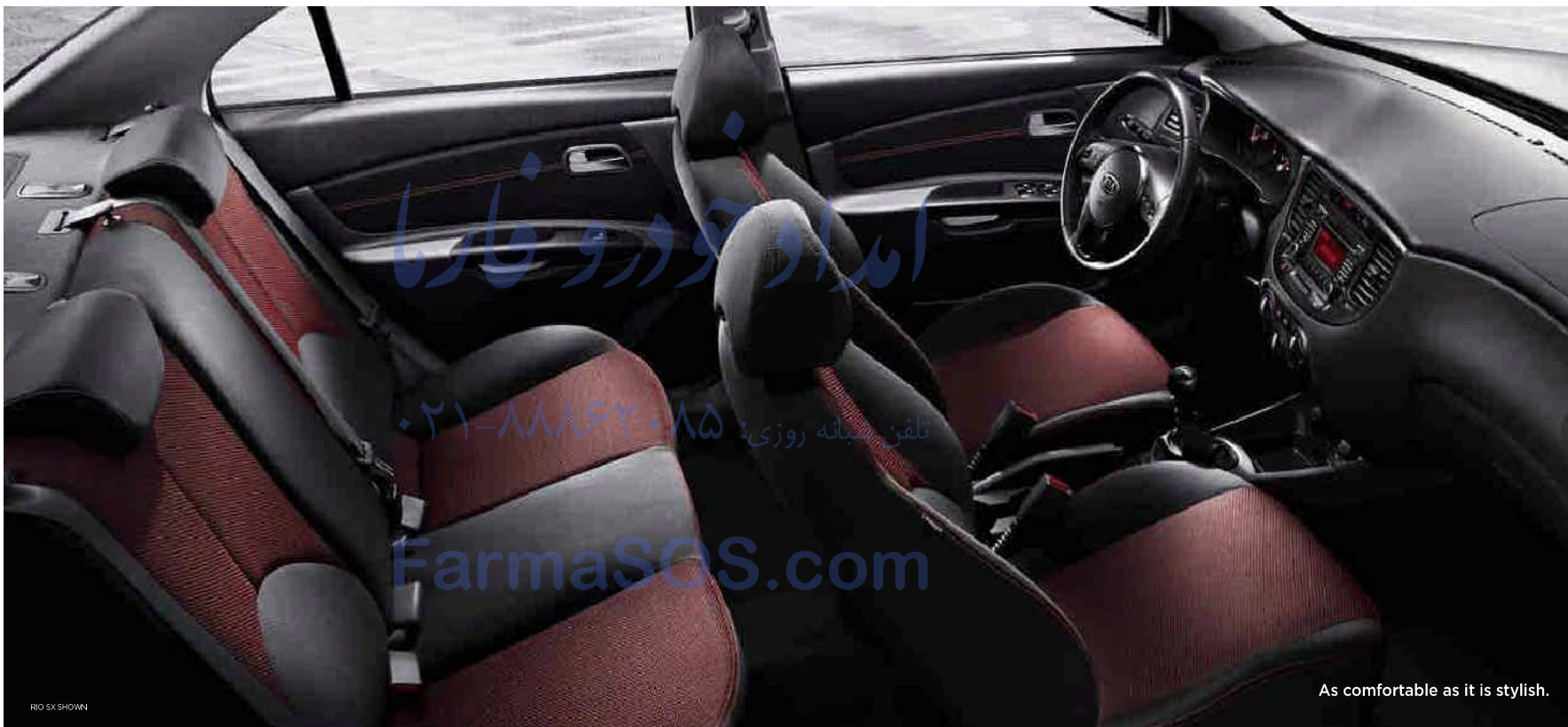
RIO SX SHOWN

16 See Specifications page for endnotes.