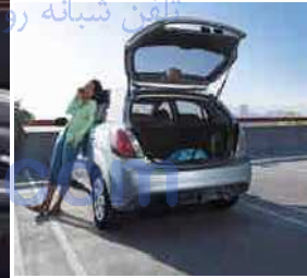
RIC'S VERSATILE HATCHBACK DESIGN The hatch allows easy loading, while the 60/40 split-folding rear seat accommodates large or bulky items. 3

The Rio is designed to help you get the most out of life every day. The Rio 4-door has a surprisingly deep and spacious trunk, so you can carry anything from sports equipment to gardening supplies. With its large hatchback, the Rio5 makes loading and unloading cargo quick and easy. An AM/FM/CD/MP3/SIRIUS audio system delivers rich audio performance, while a complimentary trial subscription to SIRIUS® Satellite Radio 2 provides you with a wealth of additional choices for music, entertainment and more. An accessory cable that plugs into the standard USB/auxiliary input jack allows you to operate your iPod® mobile digital device through the stereo. For even more convenience, LX and SX models have standard air conditioning. Welcome features such as cruise control, heated outside mirrors with turn-signal indicators, power windows and door locks and remote keyless entry are included in the Value Package.*