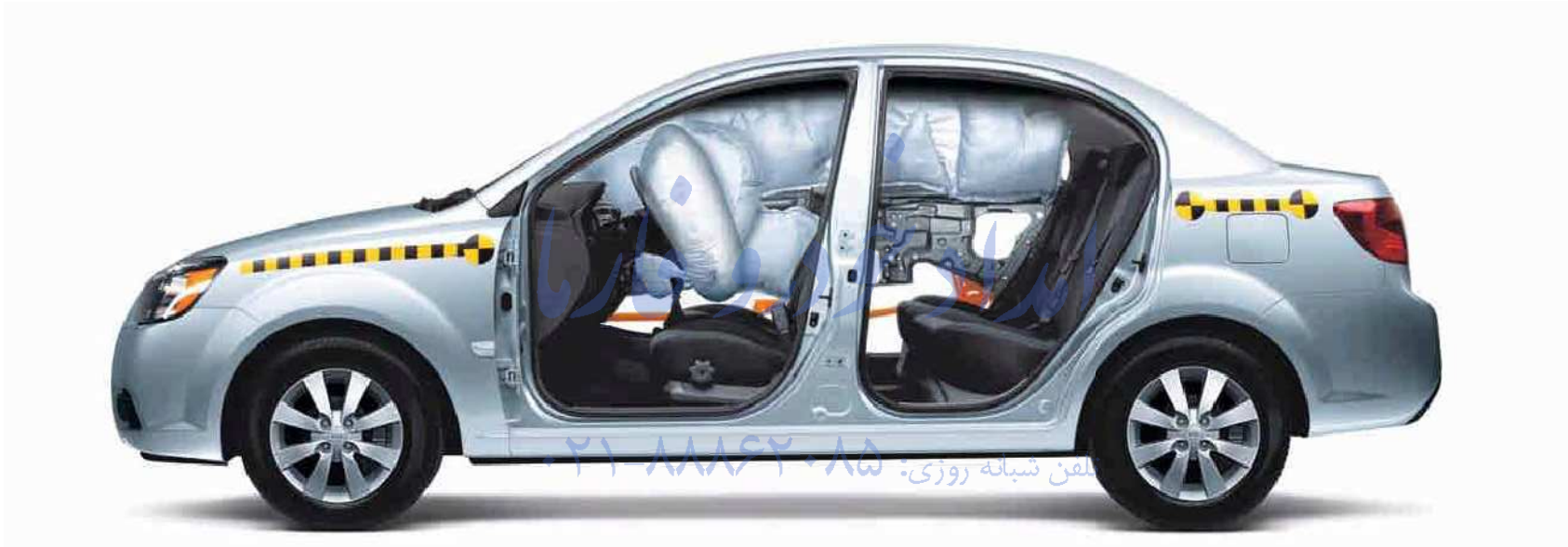
RIO LX SHOWN