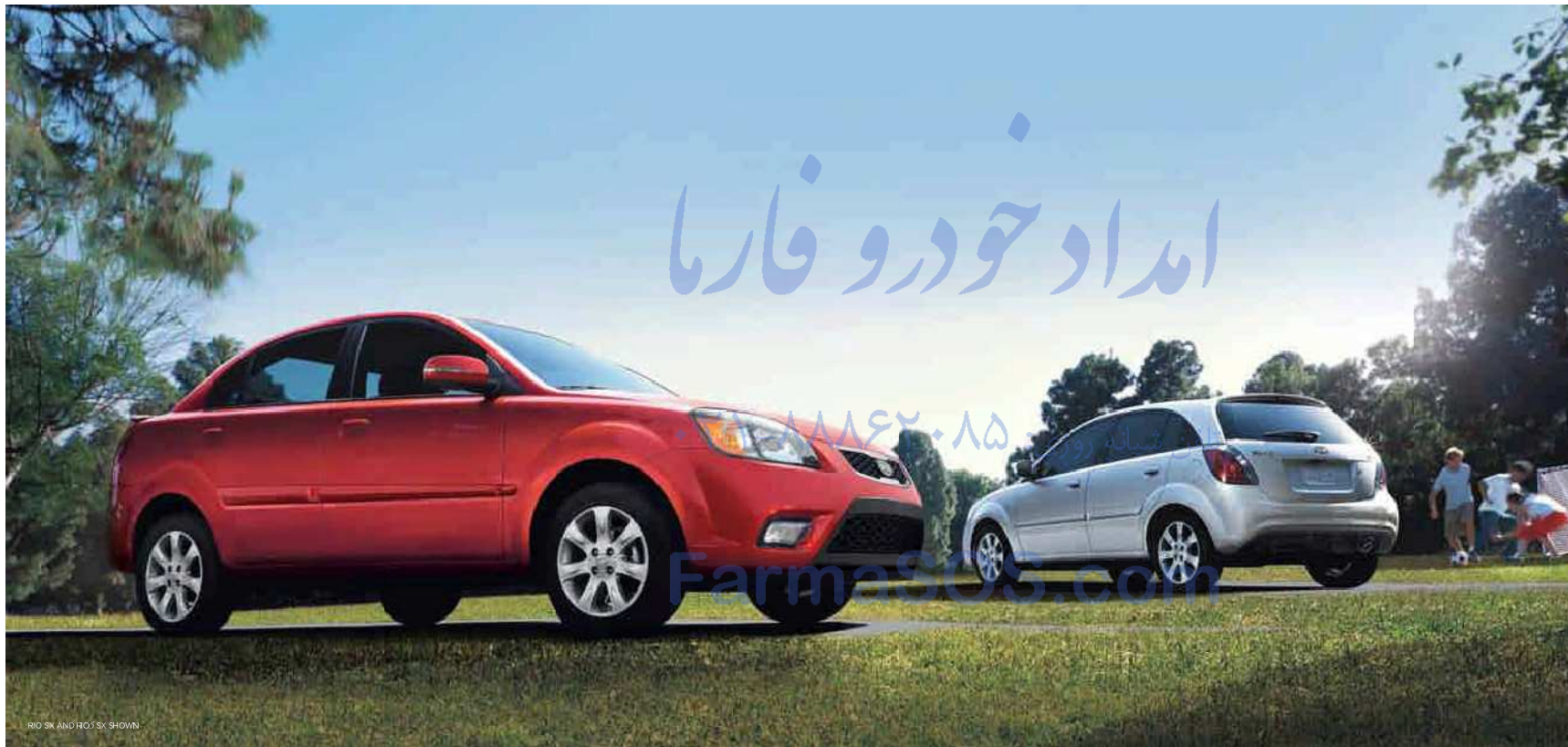
RIO SX AND RIO5 SX SHOWN