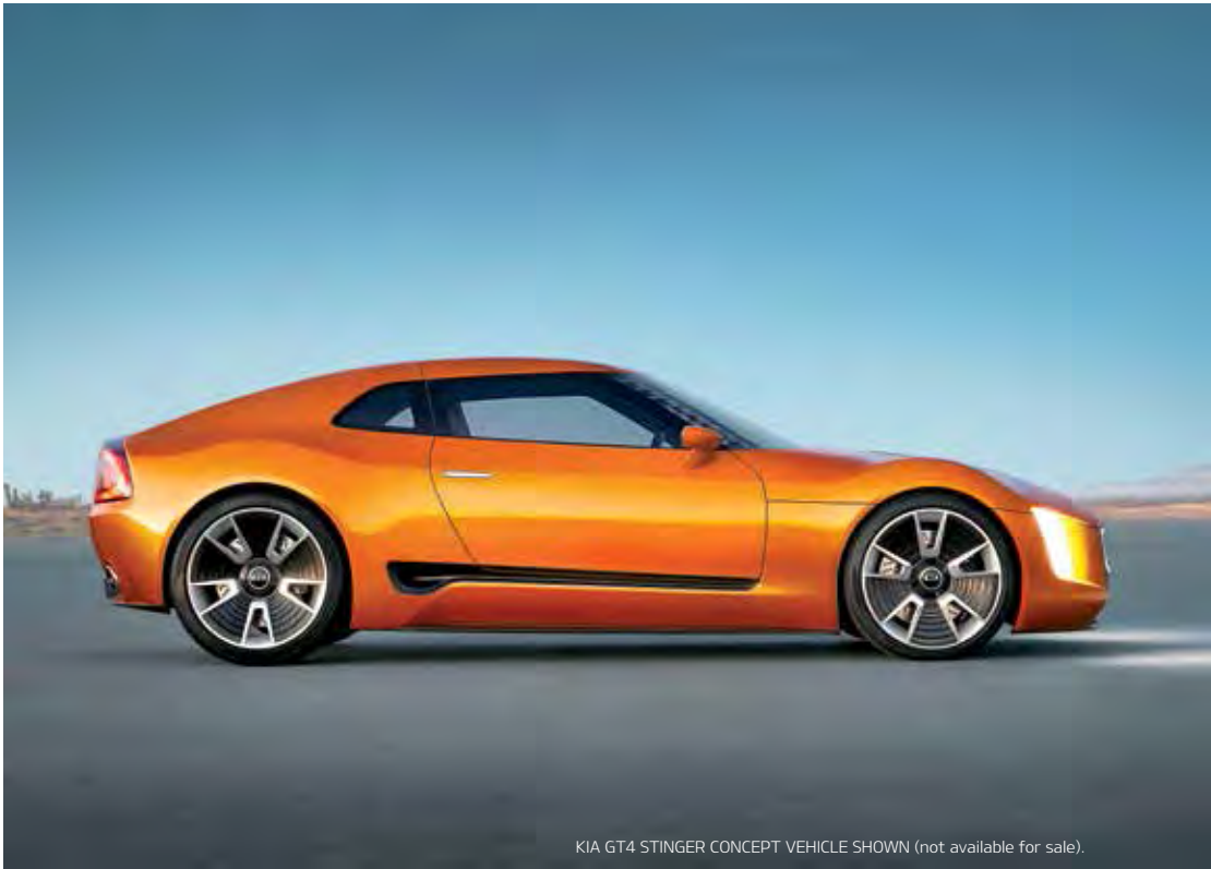
KIA GT4 STINGER CONCEPT VEHICLE SHOWN (not available for sale).