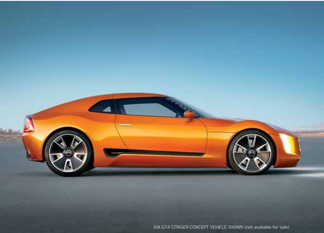
KIA GT4 STINGER CONCEPT VEHICLE SHOWN (not available for sale).